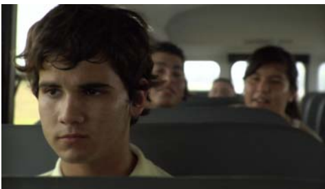
Ricky, an outsider who falls into a gang